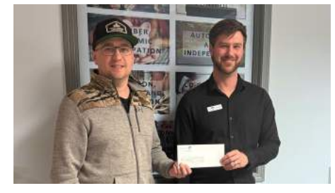
Rocky Oilmen's Assn. They're hosting their 57th Annual Golf Tournament on June 6th.