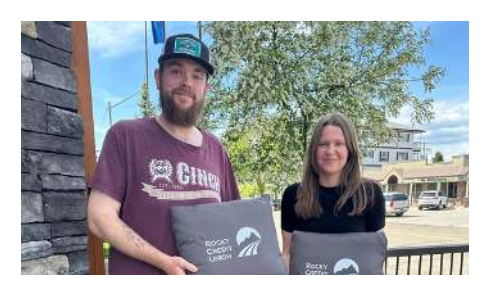
Condor Comm. Centre RCU supplied prizes for their winning Trivia Night team.