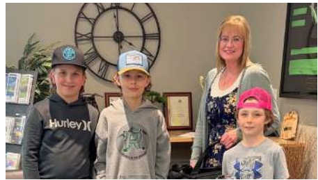
RCU supported their Ball Hockey Tournament on May 24th.