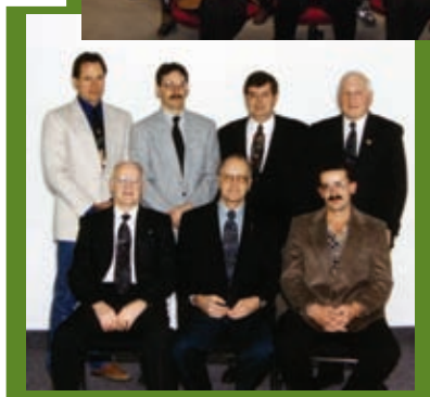
Boards of Directors through the years