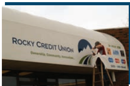
New logo in 2008